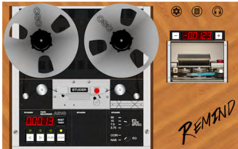
FIGURE 2 | The main graphic user interface of the REMIND app. A video of the original tape is shown outside the body of the tape recorder (top right inset) to improve its readability.

choice of whether or not the restoration should leave a trace of the source: voice and sounds recorded on a disc are linked to the noise of the disc, which is different from that of the tape. Different noises produced by a continuous transfer on different media leave a trace of the system that produced the document.